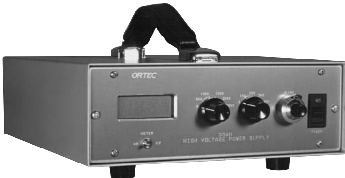
556H "Bench-Top" High-Voltage Power Supply.